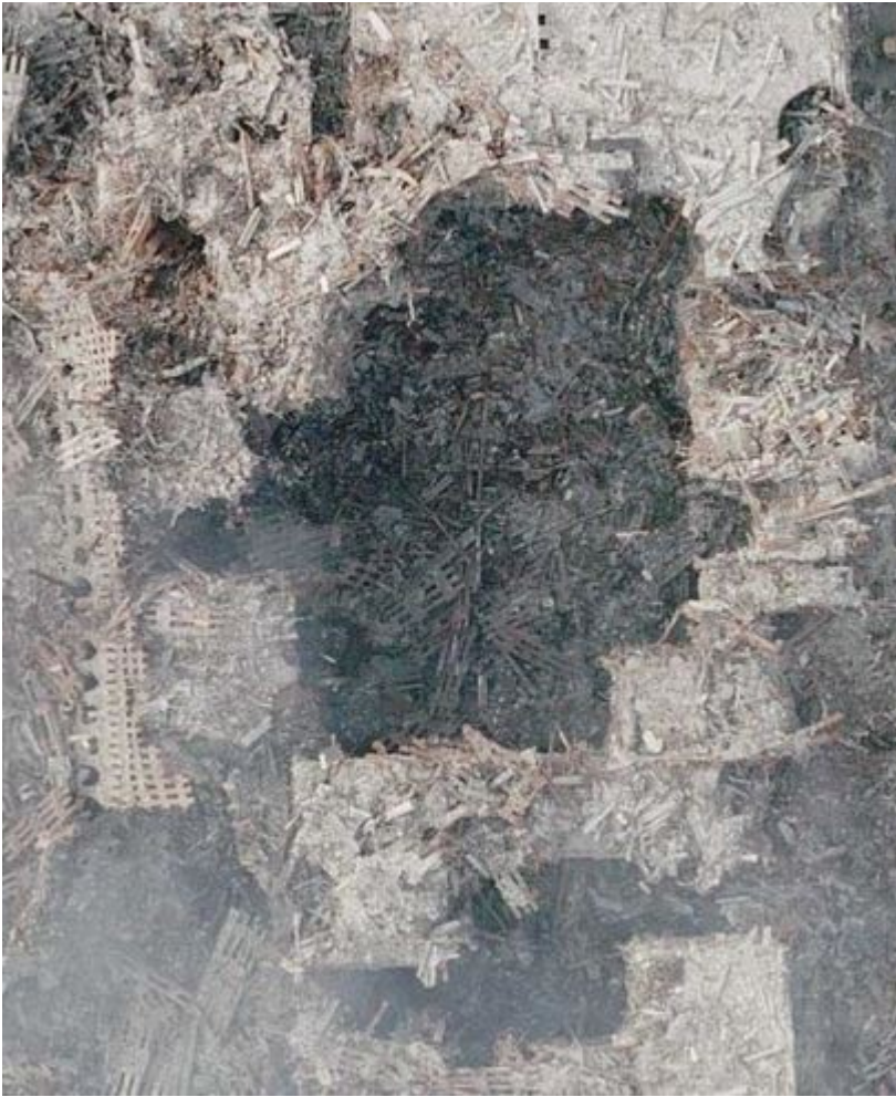
Figure 2. This image is taken from Figure 63 on DrJudyWood.com – World Trade Center aerial view shortly after 9-11. The round laser holes are obvious – they look like cookie-cutter holes. Perps are not allowed to know about this, because they will realize their FBI bosses are criminals.

drjudywood.com/articles/DEW/StarWarsBeam4.html